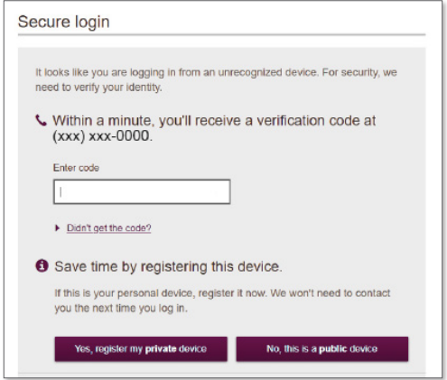
Secure login screens

NOTE : Forgotten password can only be retrieved via phone (not email), so it is important that the phone number for verification is correct.