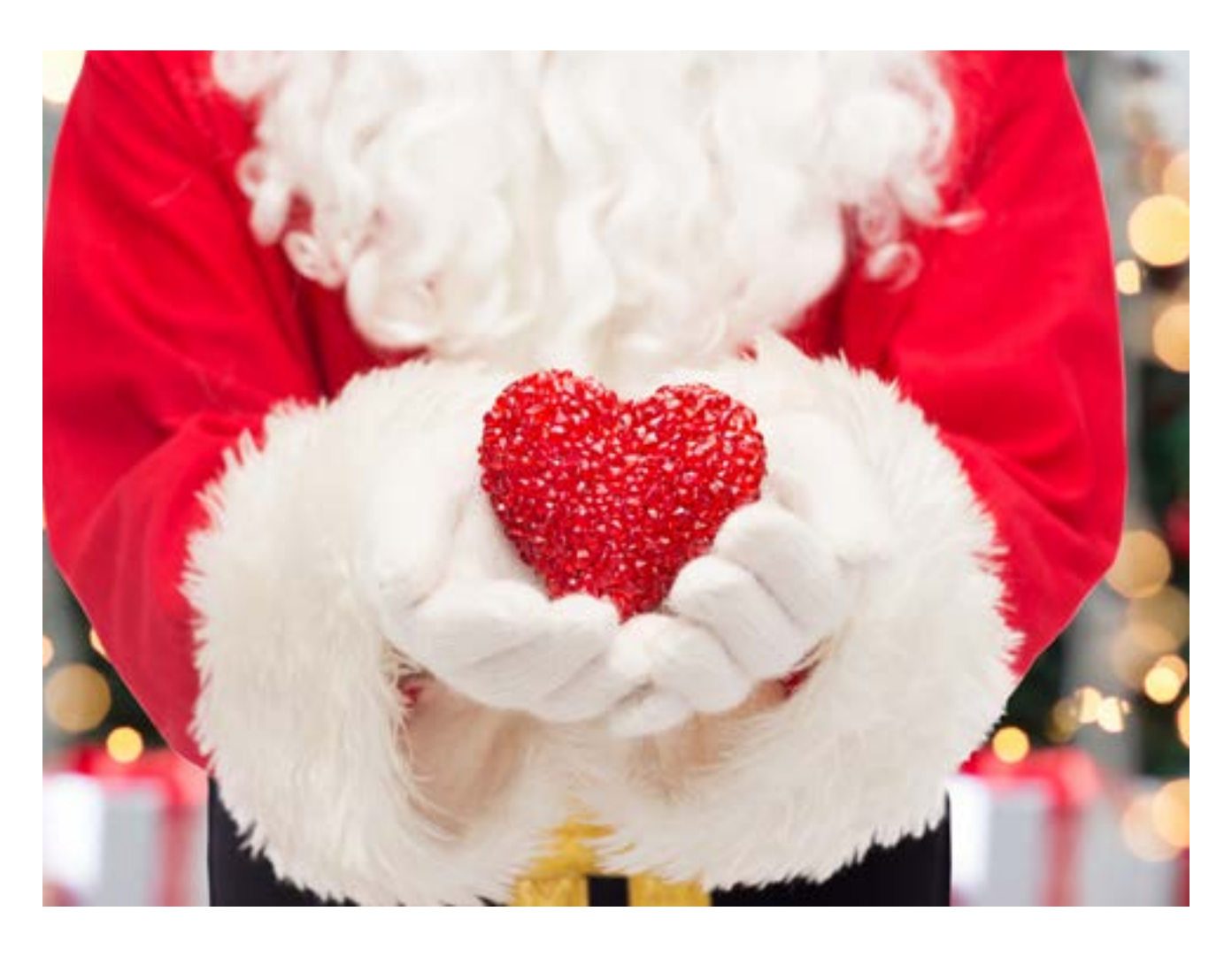
13 / KIDS & MONEY

to make others happy. Have your child invite several friends over one afternoon and ask them to prepare a small dance or a short comedy routine. Let them dig through your costume collection to outfit themselves for their grand debut and practice their gig until it's perfect. Then, deliver them to the local nursing home for spreading cheer among the residents. They'll relish the stardom and the residents will adore the little performance. That's a win-win all around!